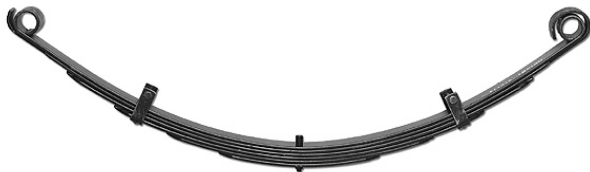
< SHACKLE END - PHOTO 7 - FRAME END (MILITARY WRAP) >