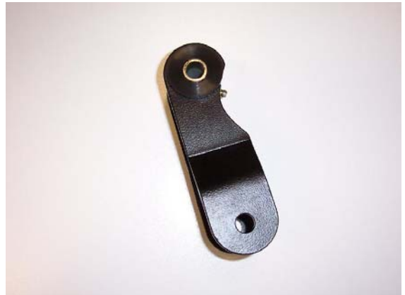
< TOWARD FRONT - PHOTO 5 - TOWARD REAR >