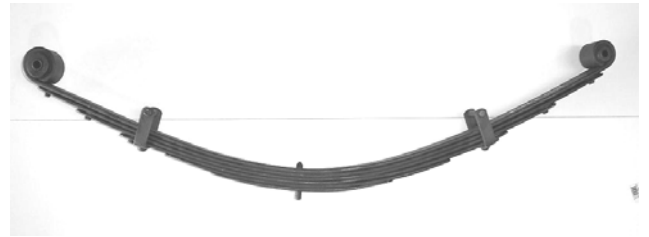
<FRAME END (LARGE BUSHING) - LEAF SPRING PHOTO 3 B