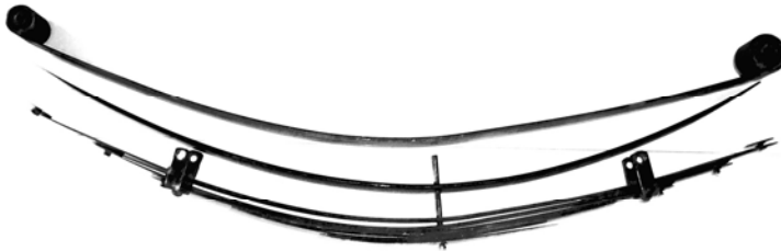
ADD-A-LEAF PHOTO 3 A